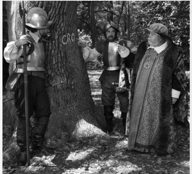
Lost Colony actors reenact the scene when John White discovered CRO, carved into a tree, a clue left behind by the missing colonists.

Provided by the NC Press Foundation, Newspapers in Education.